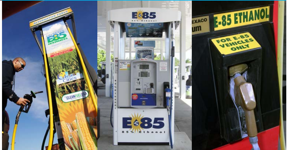
Ethanol may be labeled in a variety of ways at the pump.

the United States is essentially at the “blend wall,” a point where the only available expansion opportunities for using ethanol as a vehicle fuel will be to sell more E15 and E85.