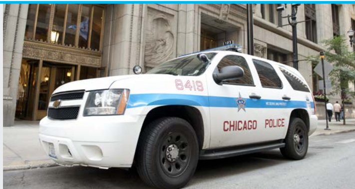
The City of Chicago's police fleet includes several hundred FFVs, such as this Chevrolet Tahoe.

To maximize petroleum displacement, the city developed a "lockout" policy for its FFVs: Using the existing fuel management system, the fleet required all city FFVs to fuel with E85 when at city fueling stations. Drivers enter vehicle identification numbers at the city's fueling kiosks, and the fuel management system directs FFV drivers to proceed to E85 dispensers.